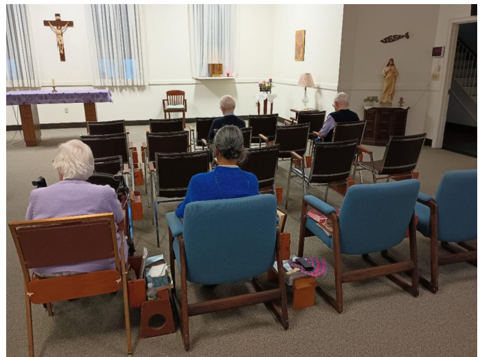
Mission of prayer