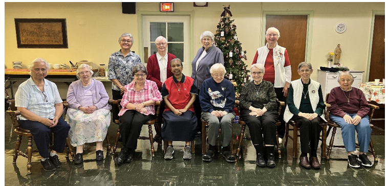
62 Newton St. community